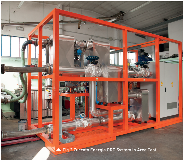
▲ Fig.2 Zuccato Energia ORC System in Area Test.