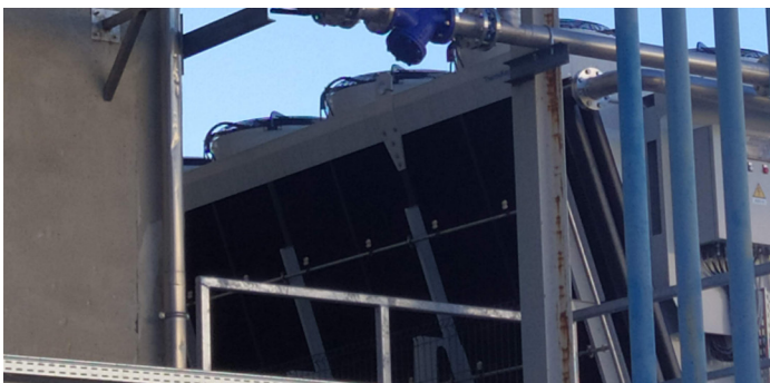
Adibetic cooler of the plant

In this way, thanks to the recovery, the customer avoided waste heat and improves the flue gas system by not having to add false air for cooling the flue gas after the filter, which would be mandatory to avoid damages to the ventilation system.